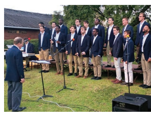
The Moody Men's Collegiate Choir during their 2016 summer tour in southern Africa.

To learn more about the reunion choir, email mmcc@moody.edu.